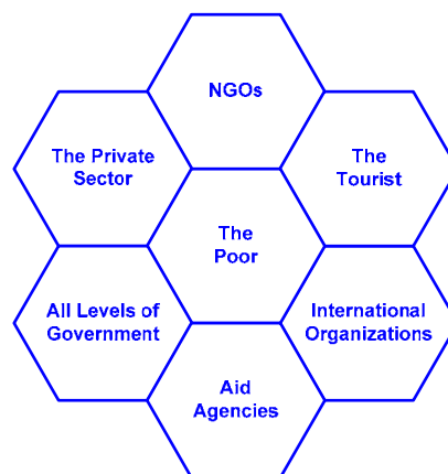
Figure 1: Key Stakeholders

There is now ample evidence to understand the role that key stakeholders tourism can play in increasing in the quality of life of individuals and communities. While the emphasis is on government led interventions stakeholder analysis would strongly support the position that a range of stakeholders must be involved in the intervention process. The key stakeholders include the following actors as can be seen in Figure 1.