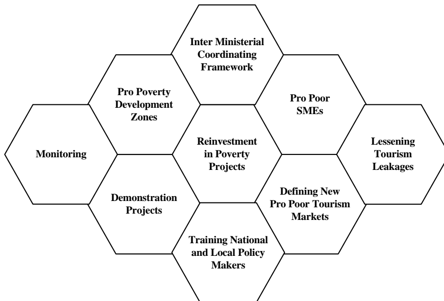
Figure 2: Potential Pro Poor Tourism Policies & Planning Approaches

Given the influential role of policy making it is clear that an important first step towards ensuring the role of tourism in reducing poverty is in the development of an appropriate policy and plan making environment. A number of policy suggestions are presented below that need to be further assessed and tested before they can be seen to be part of the “toolkit” of tourism planners and development workers. The policy and planning alternatives are presented at a glance in Figure 2.